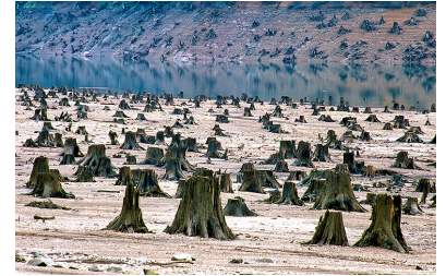
IR02: A New Dam