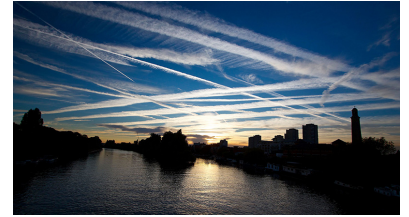
IR01: Air Traffic