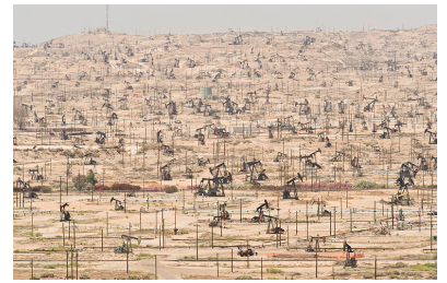
IR03: Oilfield

Named the 'Info Rugs', the patterns for the rugs were extracted from three photographs shot by the photographers at Foundation for Deep Ecology, an organisation that supports efforts to protect wilderness and wildlife. Each photograph tells a heartfelt story that also conveys the environmental impact that humans are creating.