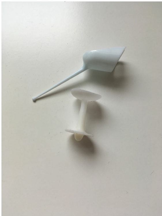
Figure 1 The Renew® anal insert and its applicator.

The older anal plug devices [13,14] have failed to gain popularity due to poor patient acceptability, despite an improvement in symptoms in those who persisted with the devices [15]. Our hypothesis is that Renew®, which is much more malleable than other anal plugs, may readily be accepted by patients and therefore prove to be an effective treatment for faecal leakage.